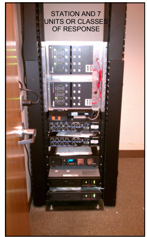
Rack Mounted Alert, Sound, Radio and UPS equipment at the Fire Station .