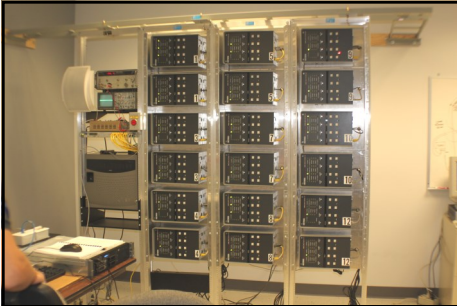
System Transponders Racked For Programming & Testing