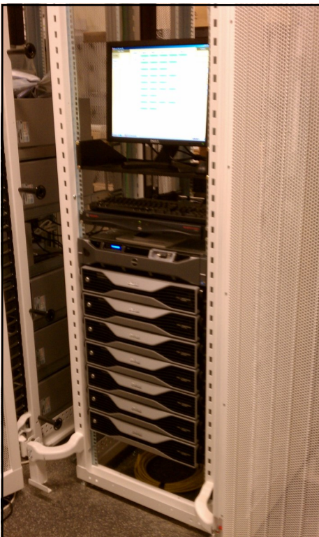
Some Systems are Configured for Remote Control of Alert Console CPU's.