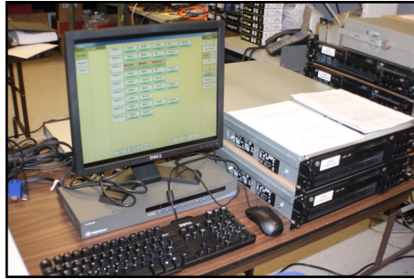
Primary and Backup Servers are Programmed & Tested