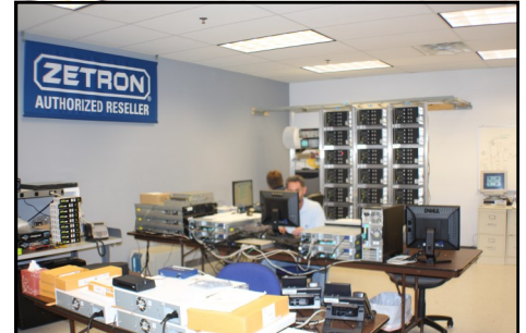
Mercury Technicians Testing All IPFSA Functions of Each Transponder